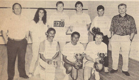
● Prize-winners at Emirates Golf Club courts